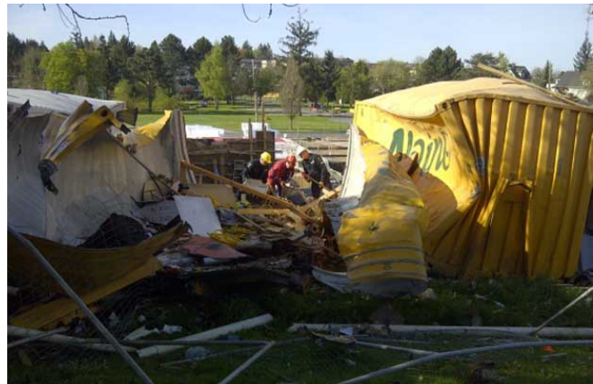
2013 shipping container explosion in Saanich B.C.

In a more recent incident, a leaking barbecue propane tank stored in a shipping container in Saanich, B.C. exploded in April 2013 and destroyed the container. Parts of the container landed 274 metres [300 yards] away and the walls were flattened. Luckily, no one was seriously injured in this incident.