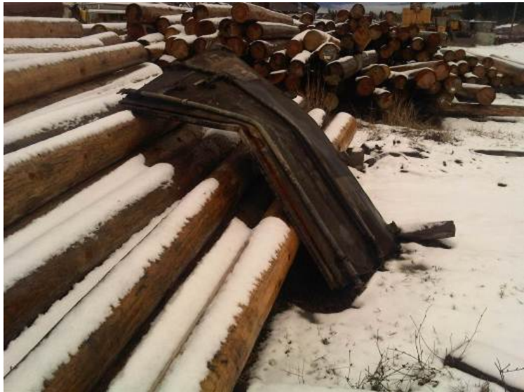
The photo above shows the bending of one of the container doors that was blown off in the explosion.

At about 5:05 a.m., a Fire Captain climbed on top of the container to attack the fire in the production building. At the time, he did not find the roof to be hot. The Incident Commander grew concerned about the possible failure of the production building structure and pulled the firefighters away from the building and shipping container. The operation went into the mop-up stage.